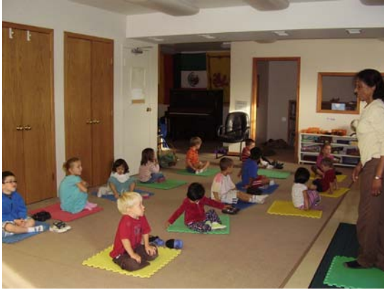
The children enjoy learning about yoga!